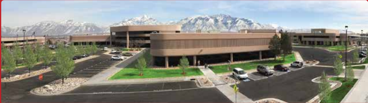
Corporate Headquarters, South Jordan, Utah

Before using, refer to Instructions for Use for indications, contraindications, warnings, precautions and directions for use.