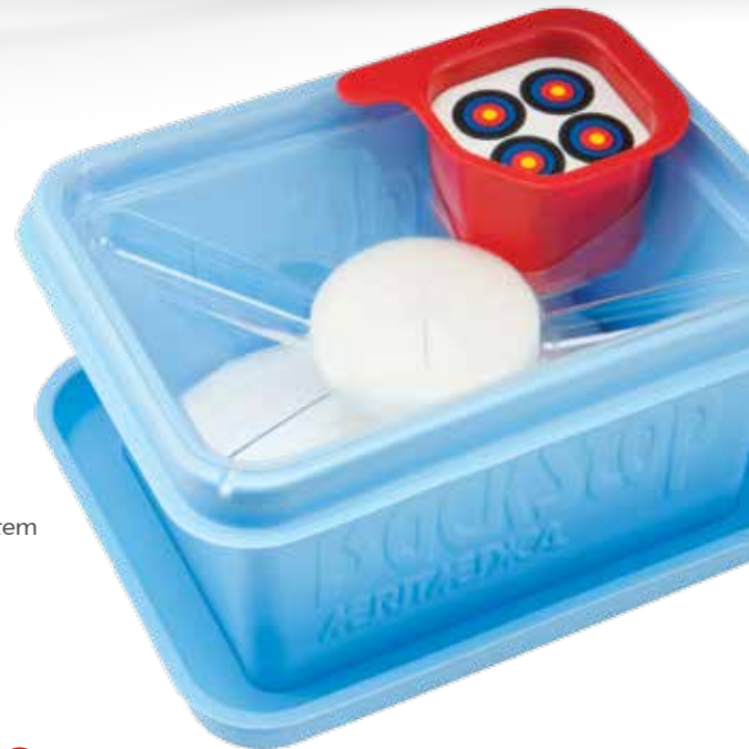
BackStop+ Disposal System