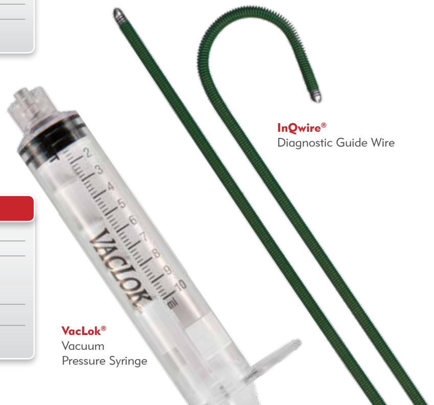
VacLok® Vacuum Pressure Syringe

IQ35F80J3 Rosen (3 mm J-tip) 0.035"(0.89 mm)