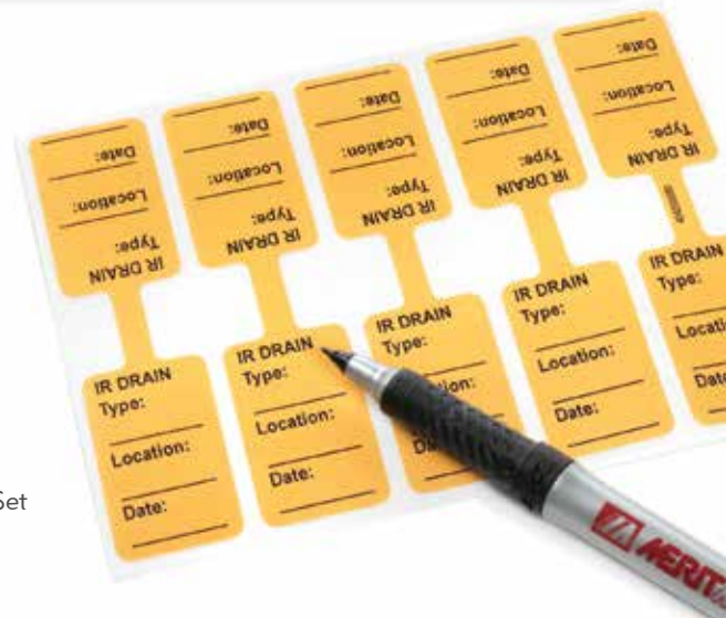
RLS™ Resolve Label Set